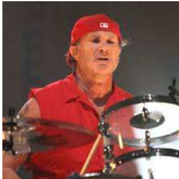
Chad Smith Red Hot Chili Peppers