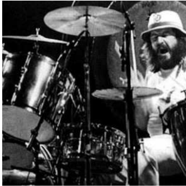
John Bonham Led Zeppelin